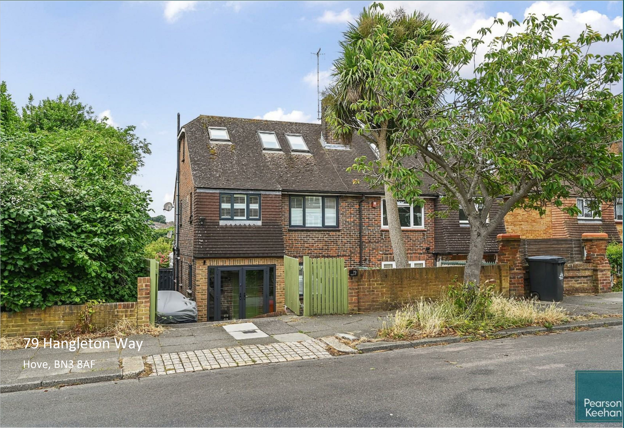
79 Hangleton Way Hove, BN3 8AF